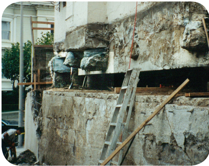
Closeup of underpinned foundation showing ends of earth-cast cantilevered beams projecting through foundation.

A large exterior retaining wall was starting to fail and endanger a Presidio Heights home. Because the house was built above and close to the retaining wall, a failure would have meant severe settlement and structural damage or partial collapse of the house.