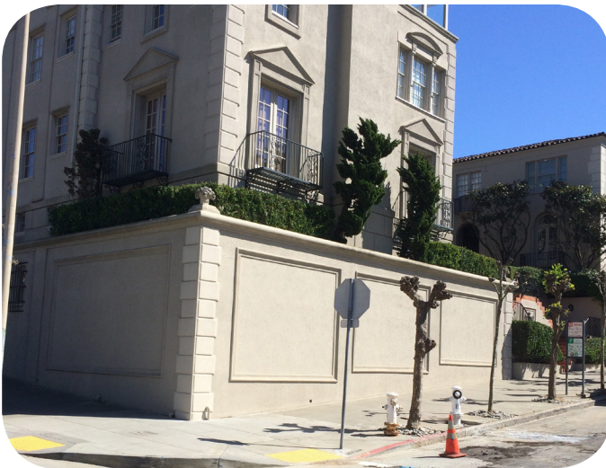
Finished wall with house secured