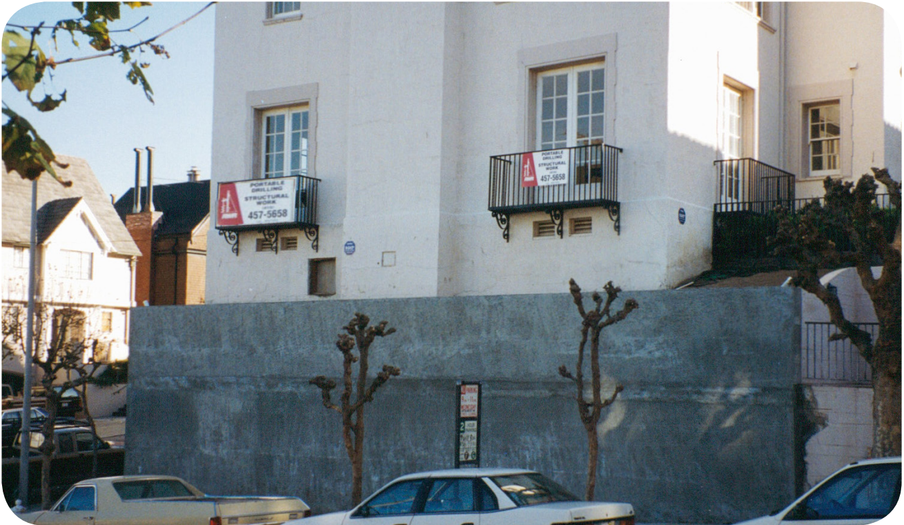
Shotcrete wall ready for finish work