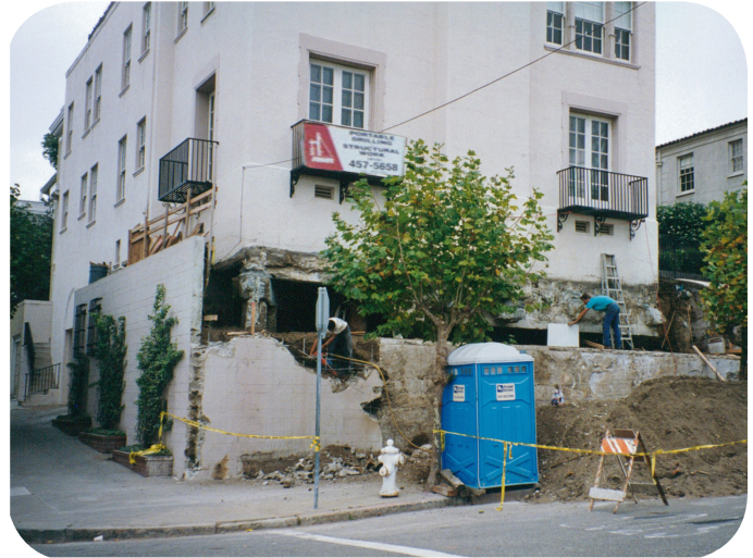
Underpinned house with top of old retaining wall removed