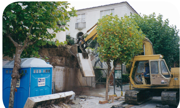
Removing failed retaining wall

Since the wall could not be removed without first supporting the house, a system of drilled piers with grade beams was installed under the house and extended beneath the exterior foundation and fireplace. These cantilevered beams supported the house while the retaining wall was demolished and replaced with a new shotcrete wall. After the structural work was complete, the wall was stuccoed and painted and the landscaping was replaced.