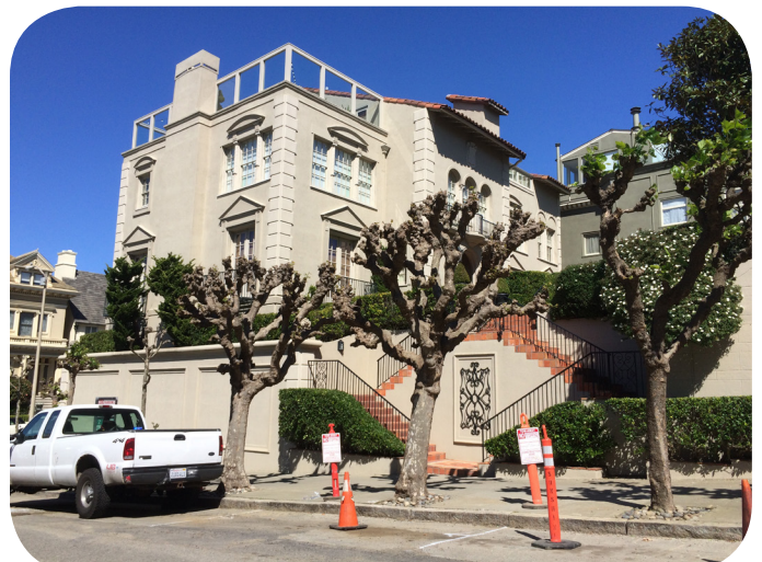
The final result

The house sits on the corner of Walnut St. doubly supported by the cantilevered shoring system left in place and the new retaining wall. Safety and property values have been fully restored and the residence is an enhancement to the neighborhood.